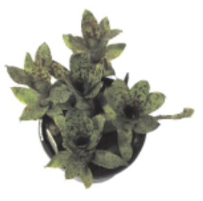
Neoregelia 'Small Fry'