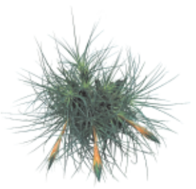
Tillandsia 'Tanya Maree'