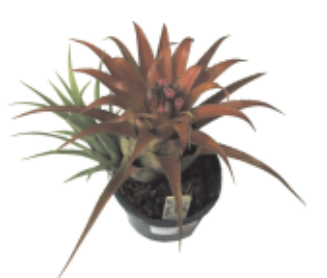
Aechmea recurvata var. benrathii