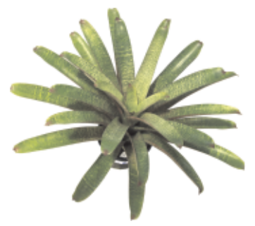
Vriesea 'Red Chestnut' x fenestralis GRAND CHAMPION