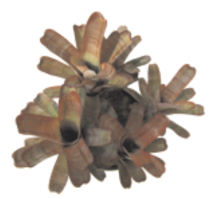
Aechmea nudicaulis var. aequalis SPECIES AWARD