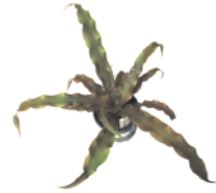
Cryptanthus 'Blood Red'