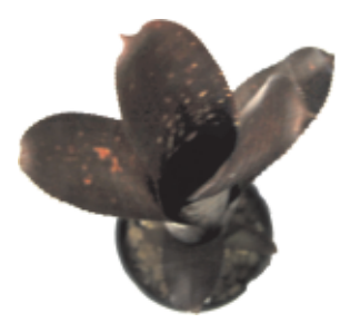
Billbergia 'Domingos Martins' x 'Georgia'