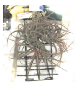
Tillandsia 'Califano Too'