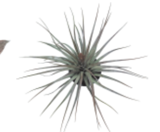
Tillandsia rothii concolor