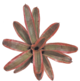
Neoregelia 'Heat Wave'