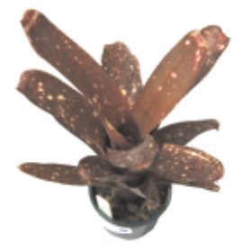
Billbergia 'Etty Bay' cv. 'Naughty Norm'