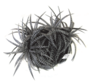
Dyckia fosteriana silver form