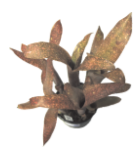
Billbergia 'Pink Champagne'