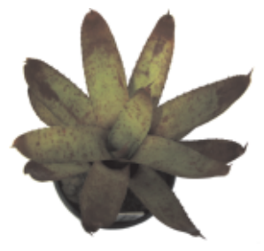
Neoregelia 'Golden Jewels'