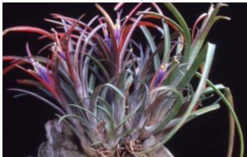
T. 'Temascal'

Two years later, Renate Ehlers visited the area and found the plant. She had collected her plant/s in Mexico, Oaxaca, 'Temascal' 150 m on rocks EM 040403, 26. 01.04. On returning home to Germany she was able to examine the collection carefully and decided they were the same and possibly of species status.