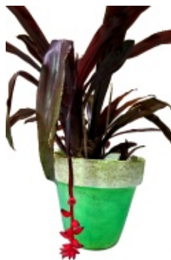
Aechmea 'Red Lacquer' or Aechmea 'Fosters Favorite'