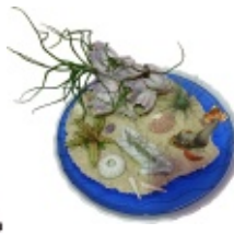
"Fruits of Broms"