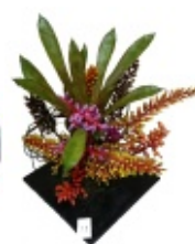
"A Fish out of Water"