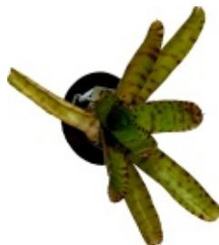
a cultivar of N. ampullacea