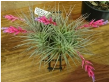
Tillandsia recurvifolia x aeranthos