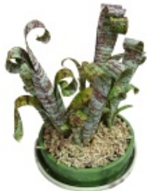
Quesnelia 'Tim Plowman'