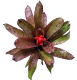
Quesnelia edmundoi V. rubrobractea