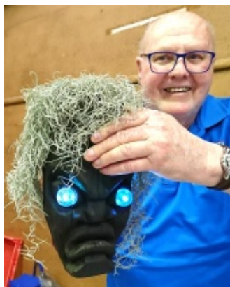
Examples of artistic bromeliad displays. "Alan's friend" artistic display took 30 seconds to create!