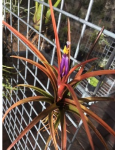
T. 'Temascal'

In this case we go back to 2002 (or was it before?) when Tropiflora Nursery in Florida found a distinctive T. capitata near Temascal, Mexico ( Comment from Dennis Cathcart – Our plants have a much longer scape, but we are not growing them as severe as you. The plants in nature were in deep shade, on a cliff face, and had leaves about 30 inches long. Ours are grown brighter, but still are quite large. ) and these were made available to keen Tillandsia growers including Len Colgan from Adelaide. Len's plant flowered with a short scape (peduncle).