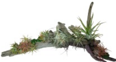
"Frog on a Log"