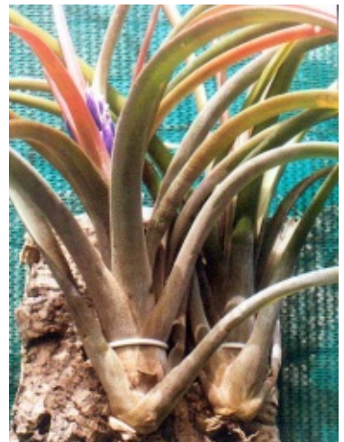
T. 'Temascal'