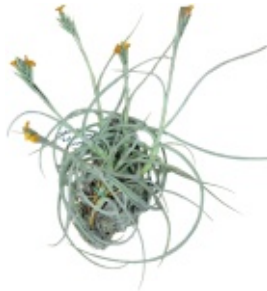
Tillandsia 'Rutschmanns Orange'