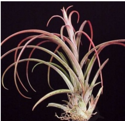
T. 'Temascal'