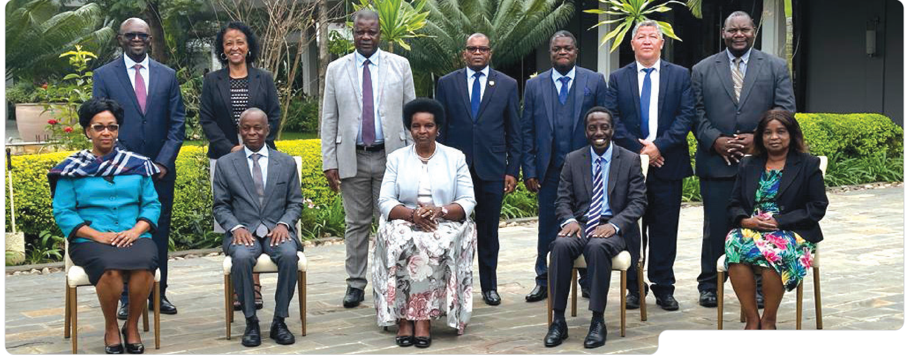
The Governing Board of ESAMI at their meeting in Arusha