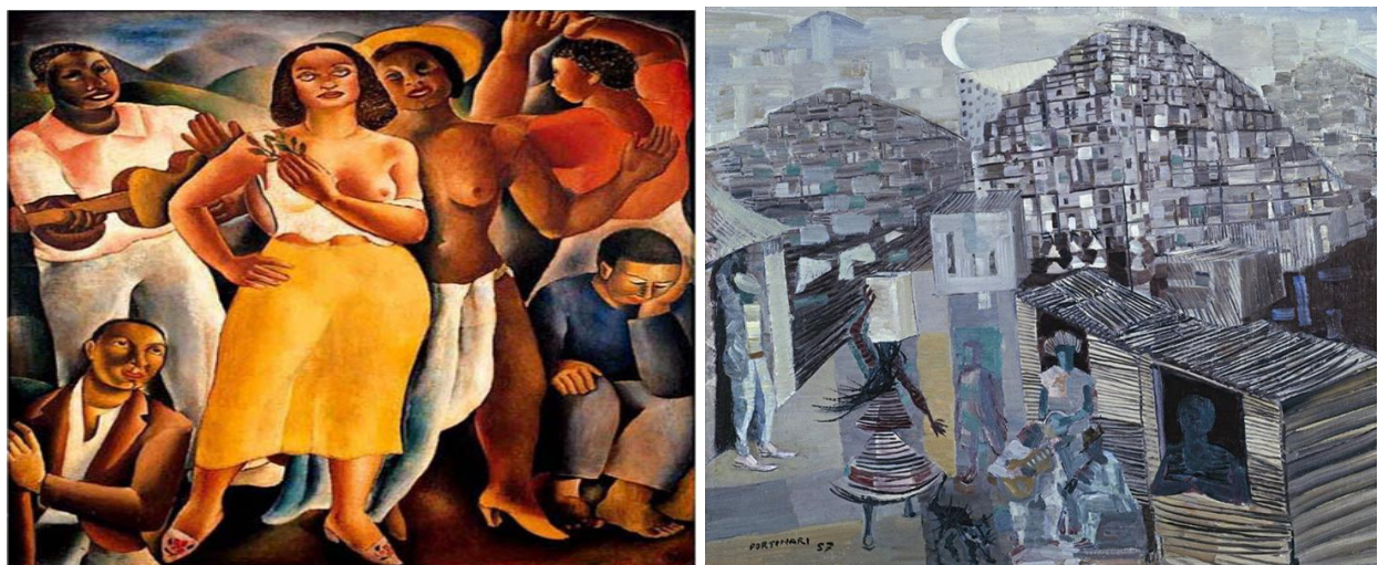
Chapter 3 | Our Latin American Roots in Modernismo's Nationalist Criticism