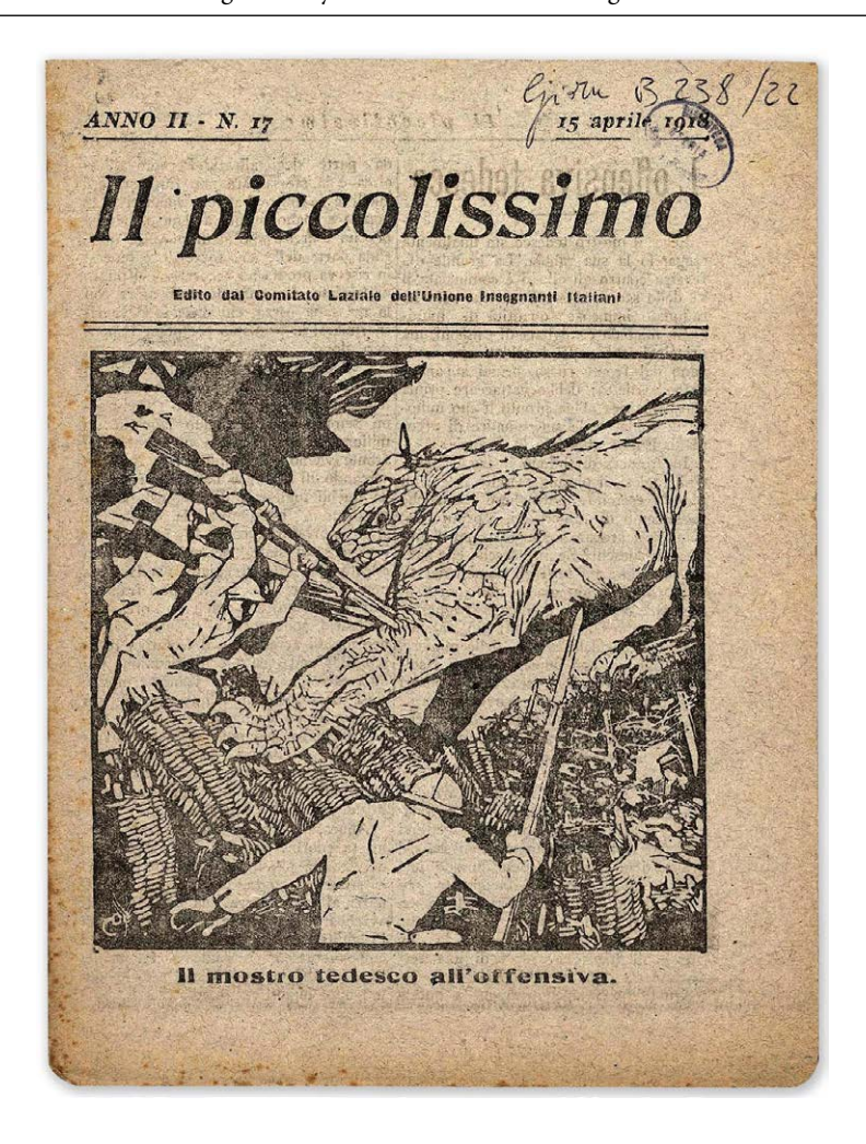
Fig. 4. The cover page of Il Piccolissimo 17/1918 Sl. 4. Naslovnica 17. broja časopisa Il Piccolissimo iz 1918. godine

This magazine is an example ante litteram of a publication which stresses the following points, claimed as distinctive features: environmental protection, responsibility for habitats, healthy nutrition, love for the surroundings and raw materials.