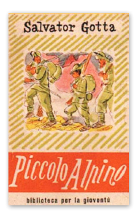
Fig. 1. The front cover of Piccolo Alpino (Gotta 1926) Sl. 1. Prednja strana korica knjige Piccolo Alpino (Gotta 1926)

In these books, authors choose some abstract concepts and allegories to describe the war, but they show more interest in a magical rather than realistic setting, with a significant inclination towards the fairy-tale world. These stories do not refer to social engagement because the intended readers are very young (less than 10 years old) and are supposed not to be able to grasp the meaning of the real conflict.