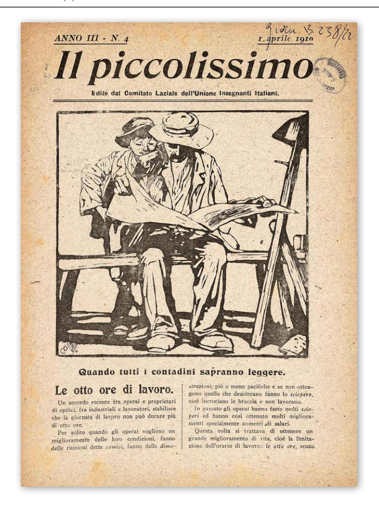
Fig. 5. The cover page of Il Piccolissimo 4/1919 Sl. 5. Naslovnica 4. broja časopisa Il Piccolissimo iz 1919. godine

In the last issue ( Il Piccolissimo 4: 1919) (Fig. 5), after about two years of publication, Il Piccolissimo abandons its readers and, while communicating gratitude for the affection with which the readers shared this traumatic but formative war experience, expresses words of hope for the future of the Italians: