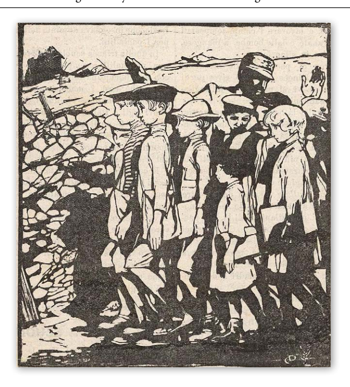
Fig. 6. The illustration from the title page of Il Piccolissimo 10/1917 Sl. 6. Slika s naslovne stranice 10. broja časopisa Il Piccolissimo iz 1917. godine