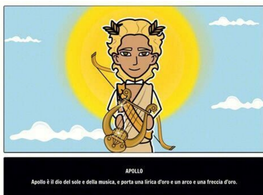
Crea a cura di Shepherd Tun

Apollo dio del sole carta d'identità. Apollo è il dio del sole. Apollo in quanto dio del sole. Dio del sole elios o apollo. Mito di apollo dio del sole. Apollo dio del sole ricerca per bambini. Apollo dio del sole disegno. Apollo il dio del sole. Apollo dio del sole scuola primaria.