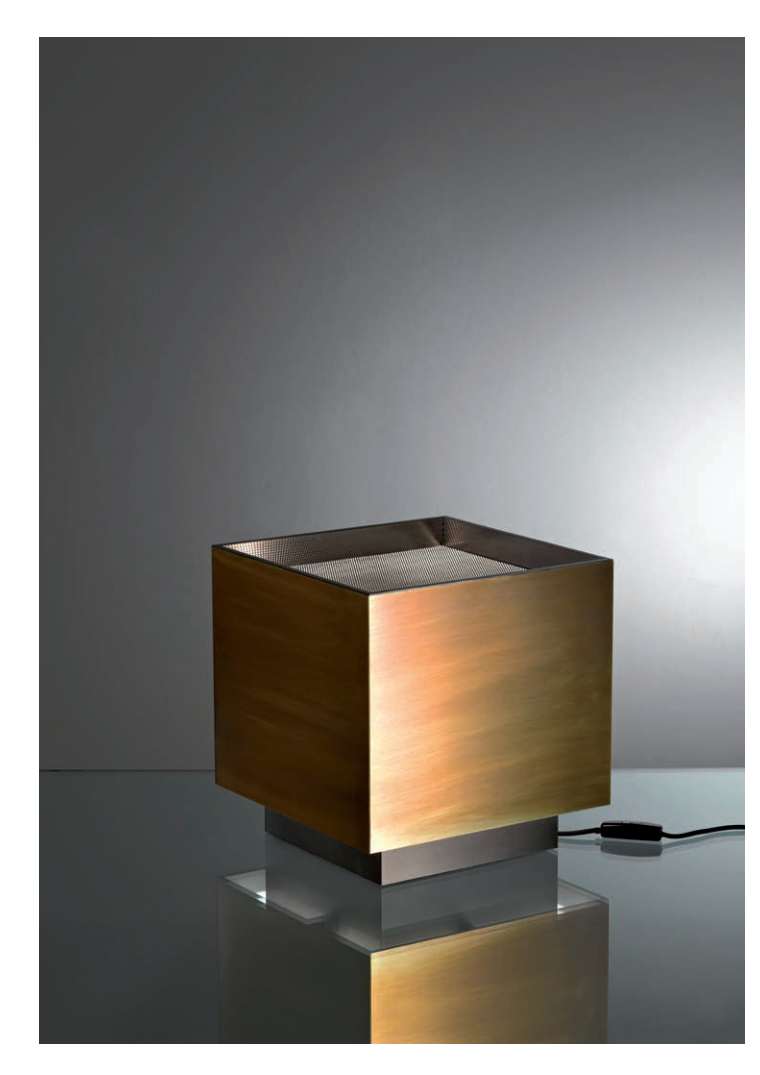
Table lamp with structure in aluminium covered with burnished brass sheets and diffusor in micro perforated stainless steel. Light Cube has an elegant cubic shape and can be used both on the table or on the floor.

Light Cube is designed to project the light upward through the diffuser. As a result, the light filters from the base creating the surprising effect of a floating cube.