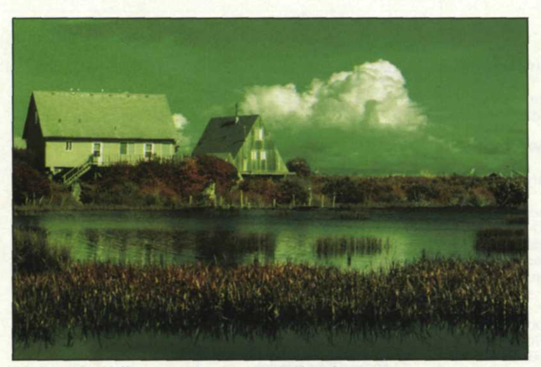
EIR shot with #12 filter, scanned and reversed in Photoshop.