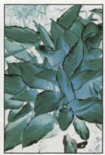
Kodak EIR shot with no filter and processed in C-41.