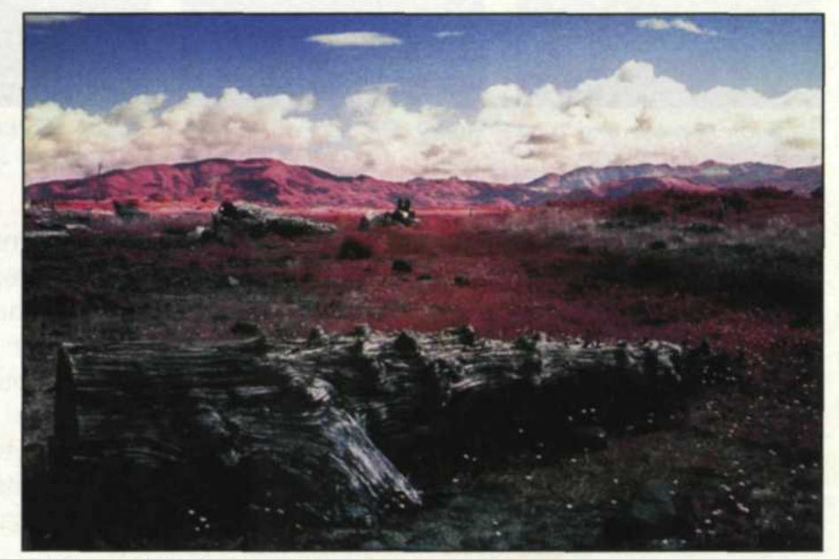
EIR Shot with #12 yellow filter.

Artistic photographers can use the film for bizarre pictorial effects with different filtration, exposure and processing. Most scenics taken with this film and a yellow filter result in a green sky and a purple or red color for green foliage. Other colored objects will be recorded in mixed proportions of green and blue. The variations are often bizarre, but limitless!