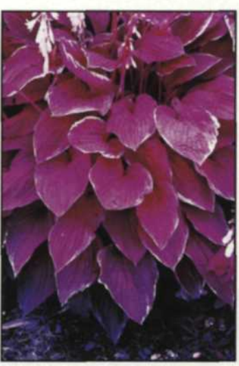
Kodak EIR normal process, E-6.