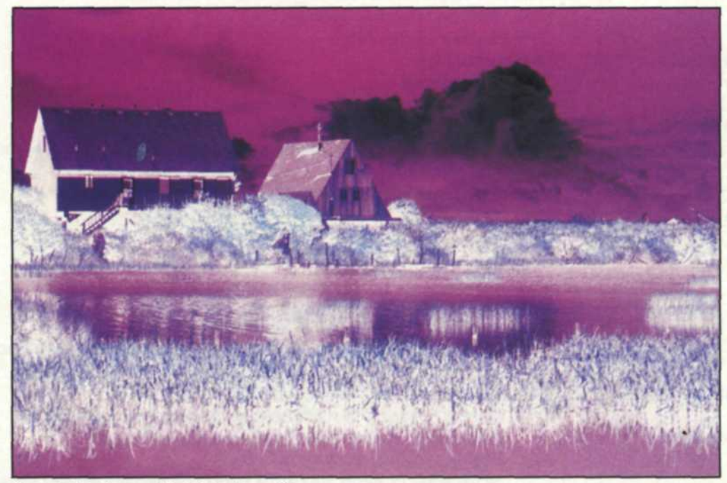
Kodak EIR show with #12 yellow filter.