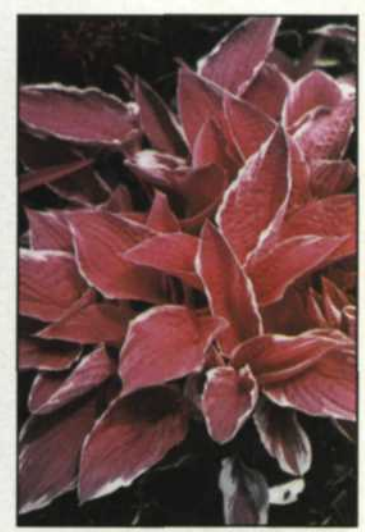
Kodak EIR shot with no filter, reversed and color-corrected in Photoshop.

exposure and processing—is first required. Kodak Ektachrome Infrared EIR is a "false color" film; in other words, the colors you actually see are not recorded as such on the film. The technical workings of the film are very complex, so here's the short version. (If you want the long version, there is the full 16-page technical document, which