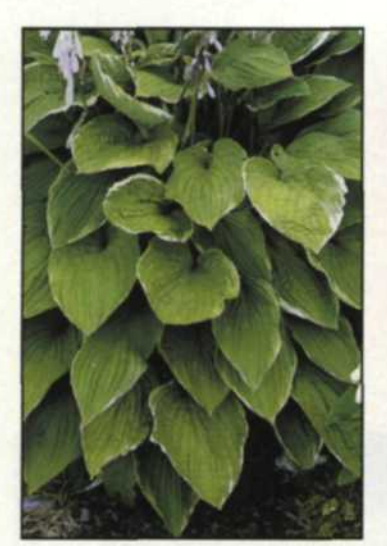
Normal, non-infrared color slide.