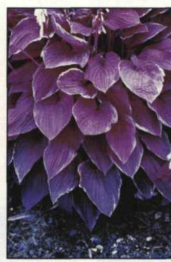
Kodak EIR pull-processed 1 stop, process E-6.